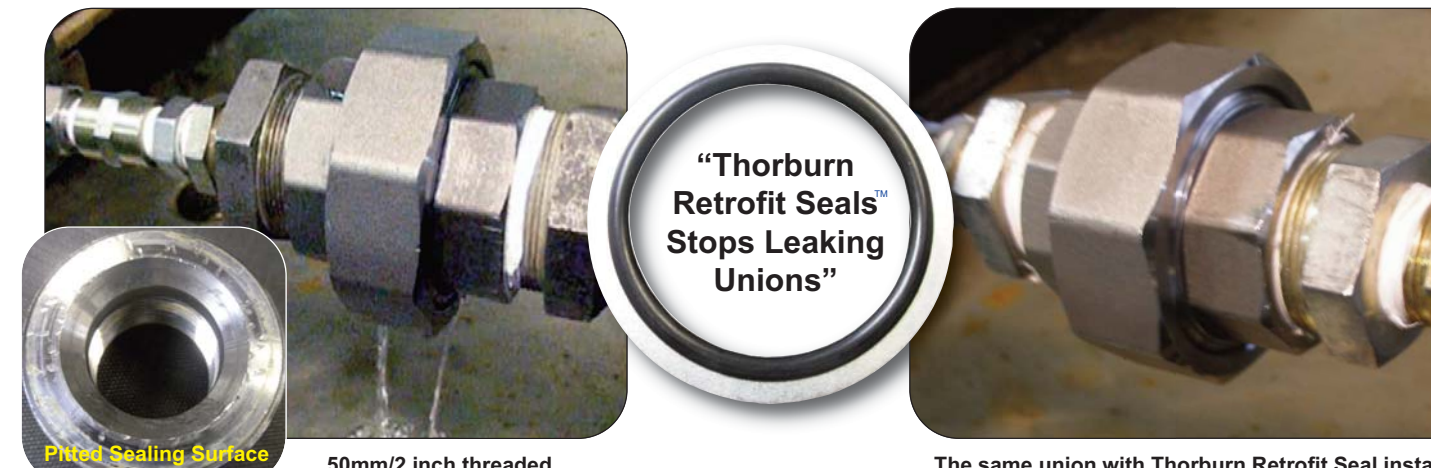
50mm/2 inch threaded metal-to-metal seal 3000lbs union (leaking at 0 psi / 0 bar)

Thorburn Retrofit Seals are specifically designed to solve union leak problems caused by sealing surfaces that are pitted, scratched or rusted by changing the metal-to-metal seal to an O-Ring seal (like a hydraulic fitting).